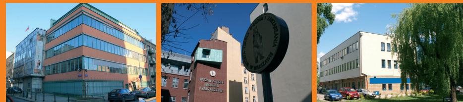
10 min. to city center